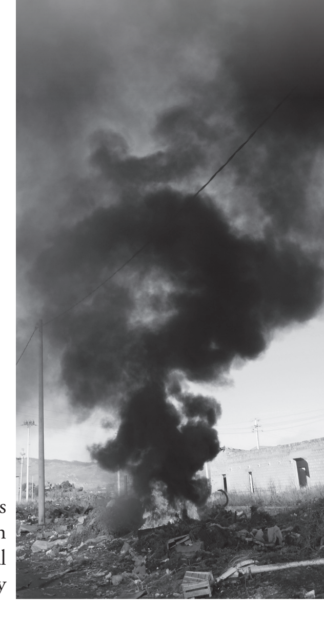
Texas Commission on Environmental Quality